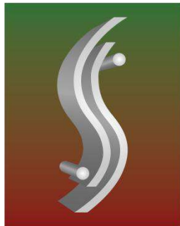
DSI SANDWICH SHOP

The DSI GPS (Gently Pressed System) is a series of fully equalized idlers, spaced closely along the length and across the belt width, gently hugging the material along the straight incline of the DSI Sandwich belt high angle conveyor.