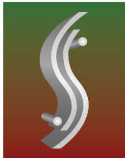
DSI SANDWICH SHOP

The DSI GPS (Gently Pressed System) is a series of fully equalized idlers, spaced closely along the length and across the belt width, gently hugging the material along the straight incline of the DSI Sandwich belt high angle conveyor.