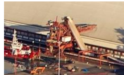
Figure 2: Sandwich Conveyor fed by low-lift tripper

Sandwich belt high angle conveyors have long been known as the best solution for tight spaces where a steep lift is required to maintain a small footprint. However, applications are also quite common in which a large footprint is available, but a high angle is needed in just a small portion of the conveyor path. Because a sandwich belt system uses a wider belt to achieve the same conveying rate as a conventional conveyor at the same speed, in an application such as that described above, the question must be asked: Should you extend the tail of the sandwich belt, or should you break up the path into two separate conveyors, in which a narrow conventional conveyor discharges on to the wider Sandwich belt system?