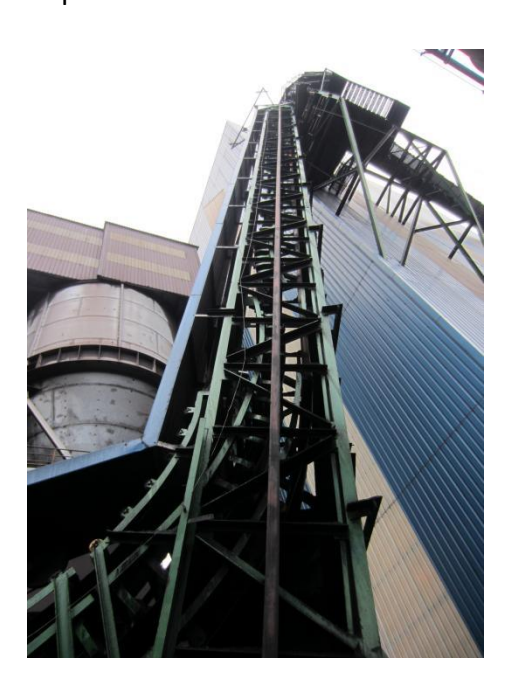
The DSI Sandwich Belt conveyor replaced a problematic pocket belt system eliminating carry back and clean up problems by scraping belts clean.

The original inquiry was for two DSI Sandwich Belt High Angle conveyors. The first conveyor would replace the troubled pocket belt system to the existing pulverizing plant. A second sandwich conveyor would elevate to the new pulverizing plant. After some analysis, PHB and DSI found they could serve both pulverizing plants with only one DSI Sandwich Conveyor instead of two. The conveying path to the new plant would pass by the existing plant, thus a single DSI Sandwich conveyor with bifurcated discharge chute and flopgate could direct the raw coal flow alternately to the new pulverizing plant. Because the DSI sandwich belts