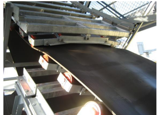
FEI's (Fully Equalized Idlers) at the inflection zones ensure continuity of hugging regardless of the conveying rate.

In order to easily handle overloads, the center rolls to either side of the inflection are not typically in contact with the belt when running at the lower rates even up to design load. The arrangement has been successful for many years at many Dos Santos Sandwich Belt systems.