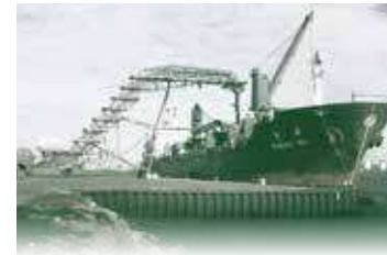
PORT & HARBOR