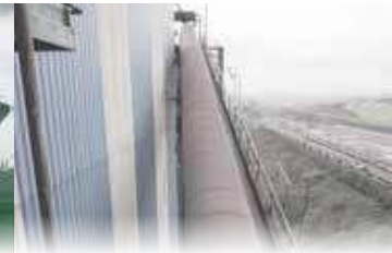
WATER & WASTE