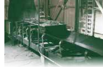
ENERGY & POWER

This in-house analytical computer software facilitates complete belt tension and power analysis of the most complicated conveyor systems under steady state running, starting, stopping and other transient conditions.