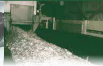
PAPER & PULP